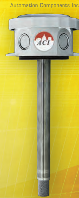
Automation Components Inc.