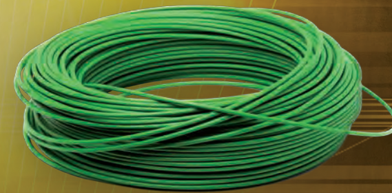
Windy City Wire