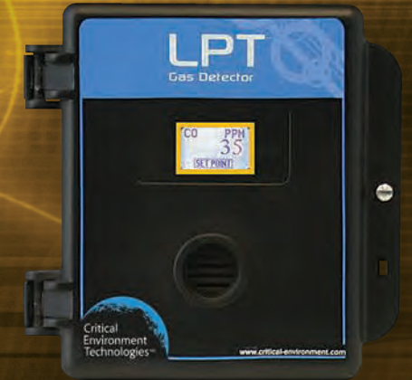
Critical Environment Technologies